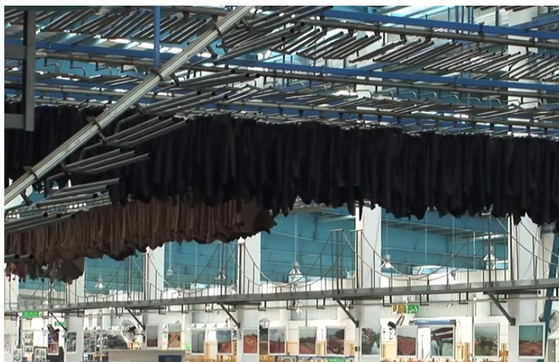
Figure 2: Heshan TanTec Ltd. hang-drying leather.

Heshan TanTec (HTL), located in Heshan City (China) handles the manufacturing bulk; it is also considered production headquarters. Ground-breaking ceremony was in 2010, with production starting in 2012. It was designed on a land size of 58,000 m 2 with 25,000 m 2 reserved for production. Monthly production capacity is 6 million ft 2 , divided into shoe leather (2 mio) and automotive leather (4 mio). As of 2014, Heshan TanTec is expanding production into leather accessories for