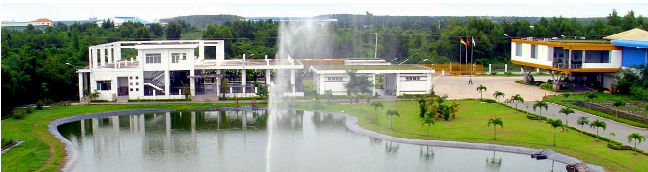
Figure 3: Saigon TanTec Ltd. production facility.

Saigon TanTec (STL), located in Saigon/Ho Chi Minh City (Vietnam) supports leather production. Ground-breaking ceremony was in 2009, with production starting in 2010. It was designed on a land size of 44,000 m 2 with 12,800 m 2 reserved for production. Monthly production capacity is 4 million ft 2 , dedicated entirely to shoe leather. This facility is the most well-received of the three, earning numerous awards such as: Energy Efficiency Award 2010 (by Dena), SATRA Certificate in QC and Lab 2011/2012 (by Satra), SATRA LWG Gold 2012 (by Leather Working Group), Sustainable Supply Chain 2014 (by Vietnam Supply Chain), Tannery of the Year 2014 (by World Leather), etc.