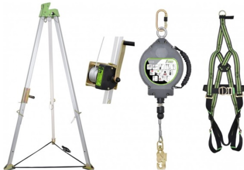
Figure 5: Tripod; winch; full body harness

If the confined space requires vertical entry, and there is not a fixed ladder, a davit arm or a tripod is necessary. A tripod is a recommended for task-specific work such as manhole entry. Tripods easily are set-up by one worker and can be transported from one location to another. One limitation of the tripod is the size of the opening it can accommodate.