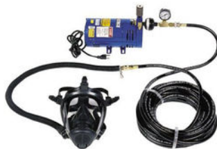
Figure 4: Airline supply system