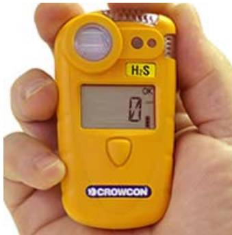
Figure 2: Personal hydrogen sulphide detector