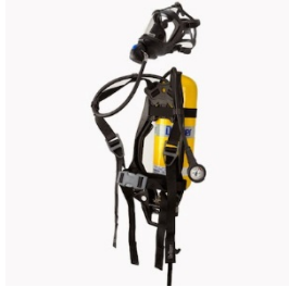
Figure 3: SCBA

SCBA mask provides the wearer a well-equipped environment with fresh air delivered to the mask breathing air from a tank. The air tank, which is under high pressure, usually will provide enough air up to an hour, but a larger version available last longer. This is required under circumstances where there is no safe air supply available, and where the operator must be provided with a safe supply of air to enable them to survive.