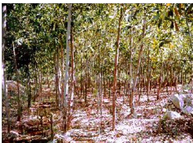
Fig.2: Mangium plantation

A view of the mangium plantation in SIDCO, which was a part of the initial experiments, is shown in Figure 2.