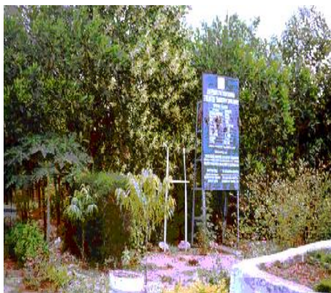
Fig. 3: Miniforest in Sidco

of effluent for irrigation. The growth of the plants was found to be good.