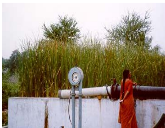
Fig 4: Reed bed in CETP-SIDCO

A view of the experimental reed bed is shown in the figure 4.