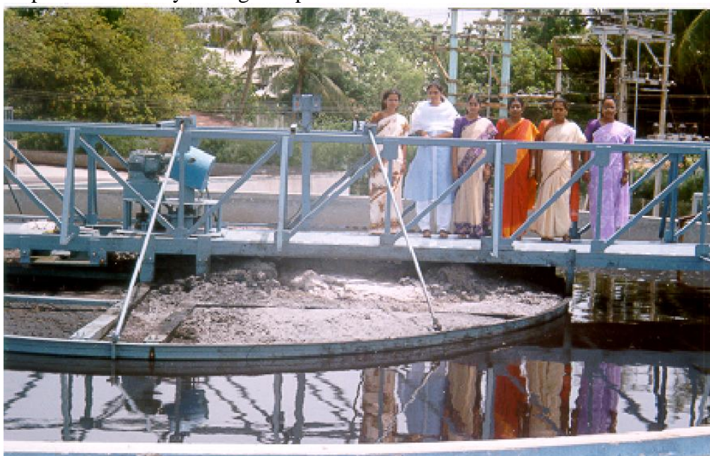
Fig 1: The managerial staff at the CETP

Besides the above technical people, 4 skilled workers and 2 administrative staff are engaged in CETP operation. All key managerial personnel of this CETP are women.