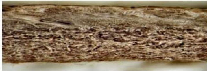
Section of leather from wool-bearing sheep showing delamination.